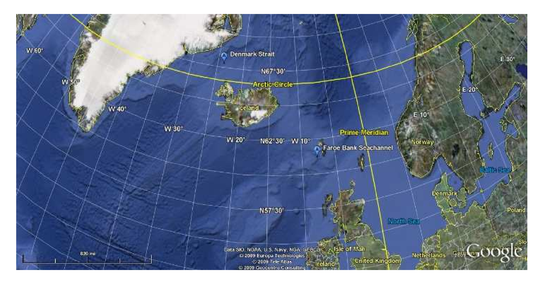
Figure 1: Aerial View of Denmark Strait and Faroe Bank Sea Channel

Although overflow occurs in many places around the globe, this research is going to focus on overflow in the North Atlantic. Two places where Overflow occurs naturally in the North Atlantic are the Denmark Strait and the Faroe Bank Sea Channel which are depicted in Figure 1.